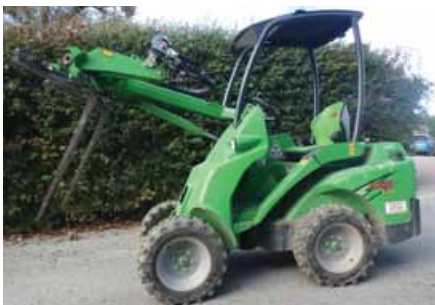
Avant loader £16,500