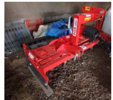
KRM 2000 power harrow £5,000