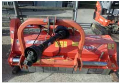
Kuhn V190 flail £2,600