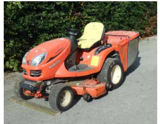
Kubota GR2120 ride-on mower £6,700