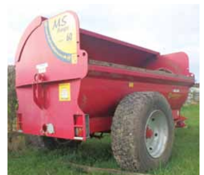
Marshall muck spreader £3,700