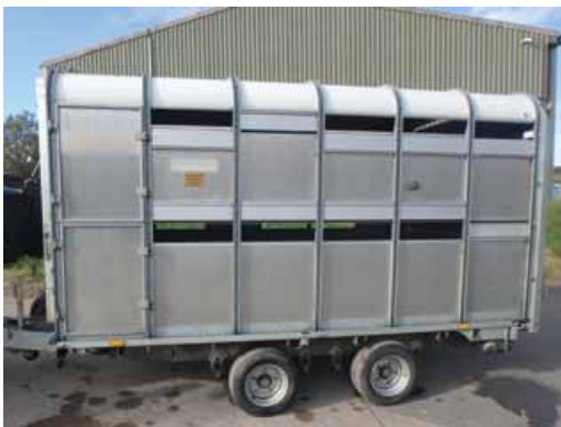
Ifor Williams livestock trailer £6,650