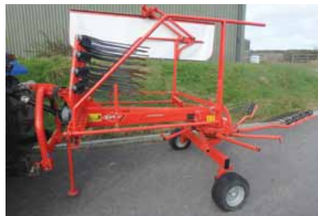
Kuhn 4121 rake £4,000