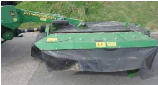
John Deere 324A mower conditioner £5,000