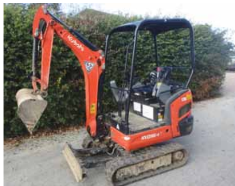
Kubota K016-4 excavator £14,200