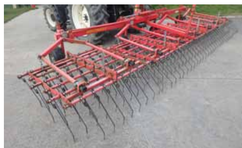
Einboeck 600 grassland manager £3,200