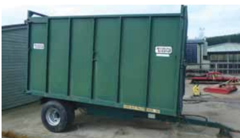
Armstrong & Holmes muck trailer £3,600