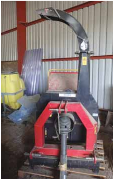
TP175 chipper £3,800