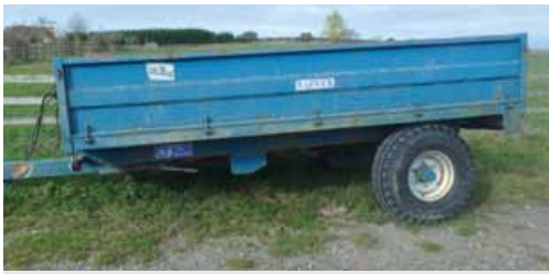
Warwick tipping trailer £2,600