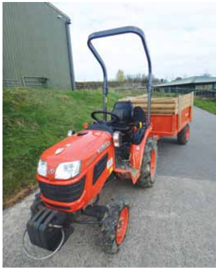
Kubota B182c compact tractor £8,400