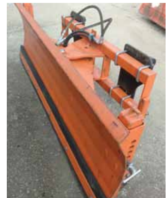
Allbutt snow plough £900

and that French Anvil with shears £270 or 317 Euros!