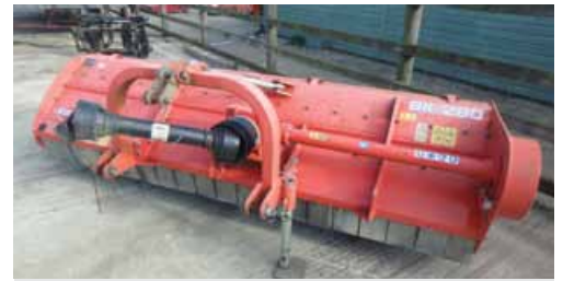
Kuhn 280 flail shredder £2,500