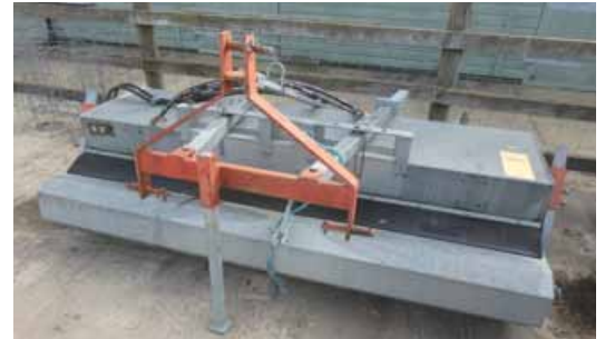
Gurney Reeve yard brush £1,200