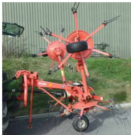
Kuhn GF 250 digi drive tedder £5,000