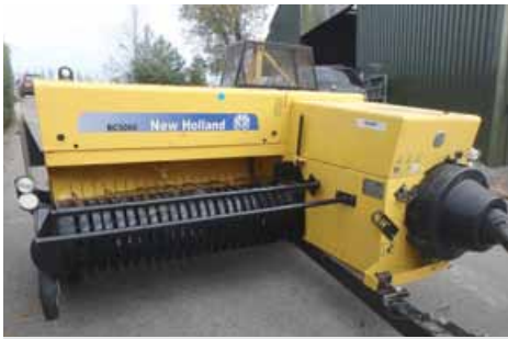
'14 New Holland BC 5060 baler £12,200