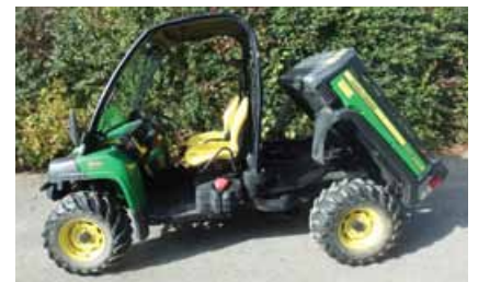
John Deere Gator 855D £13,300