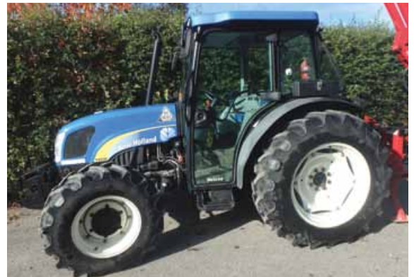
'11 New Holland 4030 £19,000