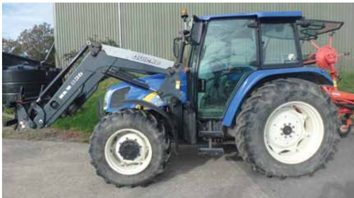
'11 New Holland 5050 £32,000