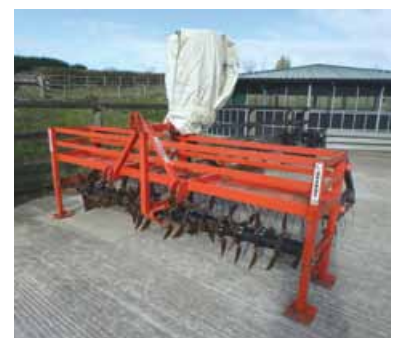
Browns slit & harrows £3,120