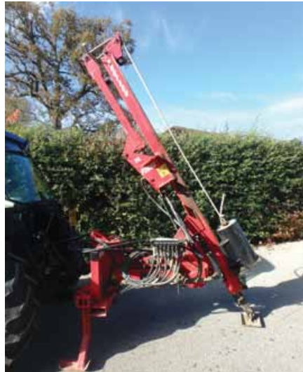
Pro tech P200s post knocker £3,400